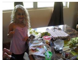
Decorating Christmas Cookies !!