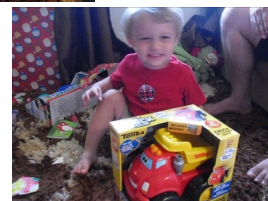
Of coarse Playing with the new toys!